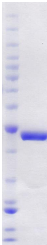
Coomassie blue-stained SDS-PAGE (4-12% acrylamide) of 4 µg of RBC Bcl-2 (GST). MW markers (left) are, from top, 220, 160, 120, 100, 90, 80, 70, 60, 50, 40, 30, 25, 20, 15, 10 kDa.

STORAGE: -70°C. Thaw quickly and store on ice before use. The remaining, unused, undiluted protein should be snap frozen, for example in a dry ice ethanol bath or liquid nitrogen. Minimize freeze/thaws if possible, but very low volume aliquots (<5 µl) or storage of diluted enzyme is not recommended.