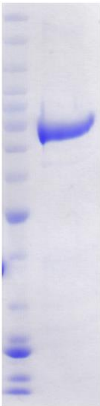
Coomassie blue-stained SDS-PAGE (12% acrylamide) of 4 µg of RBC EED FL (GST). MW markers (left) are, from top, 220, 160, 120, 100, 90, 80, 70, 60, 50, 40, 30, 25, 20, 15, 10 kDa.

REFERENCES: 1) R. Cao et al. Science 2002 298 1039; 2) K. Plath et al. Science 2003 300 131; 3) J. Silva et al. Dev. Cell 2003 4 481; 4) S. Erhardt et al. Development 2003 130 4235; 5) R. Cao & Y. Zhang Curr. Opin. Genet. Dev. 2004 14 155