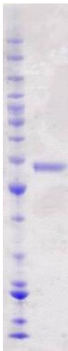
Coomassie blue stained SDS-PAGE (4-12% acrylamide) of 2 \mu g of purified SETD2 (GST). MW markers (left) are, from top, 220, 160, 120, 100, 90, 80, 70, 60, 50 , 40, 30, 25, 20, 15 & 10 kDa.

REFERENCES: 1) X.-J. Sun et al. J. Biol. Chem. 2005 280 35261; 2) J.W. Edmunds et al. EMBO J. 2008 27 406; 3) M. Hu et al. Proc. Natl. Acad. Sci. USA 2010 107 2956; 4) W. Al Sarakbi et al. BMC Cancer 2009 9 290; 5) R.F. Newbold & K. Mokbel Anticancer Res. 2010 30 3309; 6) G. Duns et al. Cancer Res. 2010 70 4287