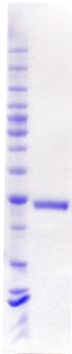
Coomassie blue stained SDS-PAGE (4-12% acrylamide) of 2 μg of purified RBC SMYD3. MW markers (left) are, from top, 220, 160, 120, 90, 70, 60, 50 , 40, 30, 25, 20 , 15, 10 kDa.

REFERENCES: 1) P.D. Gottlieb et al. Nat. Genet. 2002 31 25; 2) R. Hamamoto et al. Nat. Cell Biol. 2004 6 731; 3) M.A. Brown et al. Mol. Cancer 2006 5 26; 4) T.V. Riera, et al. Kinetic Mechanism of the Lysine Methyltransferase Smyd3 Using MAP3K2 Protein Substrate. Poster session presented at: AACR 106th Annual Meeting 2015; April 18-22, 2015; Philadelphia, PA; 5) Mazur et al. Nature 2014 510(7504) : 283-7.