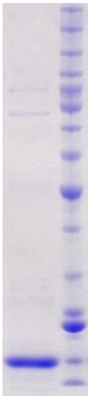
Coomassie blue-stained SDS-PAGE (12% acrylamide) of 6µg of RBC cIAP1-BIR3 (nHis, cStrepII). MW markers (left) are, from top, 220, 160, 120, 100, 90, 80, 70, 60, 50, 40, 30, 25, 20, 15, 10 kDa.

STORAGE: -70°C. Thaw quickly and store on ice before use. The remaining, unused, undiluted protein should be snap frozen, for example in a dry ice ethanol bath or liquid nitrogen. Minimize freeze/thaws if possible, but very low volume aliquots (<5 µl) or storage of diluted enzyme is not recommended.