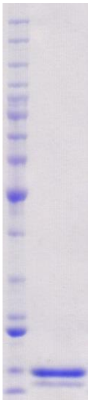
Coomassie blue-stained SDS-PAGE (4-12% acrylamide) of 4 \mu\text{g} of RBC cIAP2-BIR3 (nHis, cStrepII). MW markers (left) are, from top, 220, 160, 120, 100, 90, 80, 70, 60, 50, 40, 30, 25, 20, 15, 10 kDa.

STORAGE: -70°C. Thaw quickly and store on ice before use. The remaining, unused, undiluted protein should be snap frozen, for example in a dry ice ethanol bath or liquid nitrogen. Minimize freeze/thaws if possible, but very low volume aliquots (<5 \mu\text{l} ) or storage of diluted enzyme is not recommended.