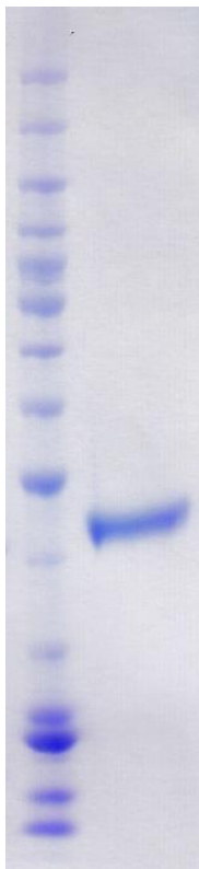
Coomassie blue-stained SDS-PAGE (4-12% acrylamide) of 4 µg of RBC HDAC8. MW markers (left) are, from top, 220, 160, 120, 100, 90, 80, 70, 60, 50, 40, 30, 25, 20, 15, 10 kDa.

STORAGE: -70°C. Thaw quickly and store on ice before use. The remaining, unused, undiluted protein should be snap frozen, for example in a dry/ice ethanol bath or liquid nitrogen. Minimize freeze/thaws if possible, but very low volume aliquots (<5 µl) or storage of diluted enzyme is not recommended.