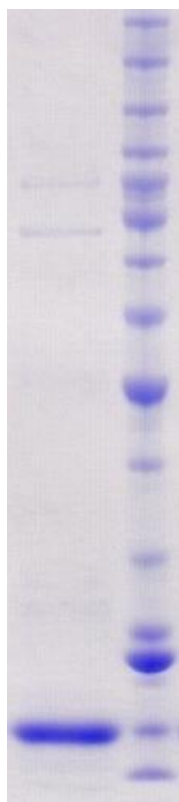
Coomassie blue-stained SDS-PAGE (12% acrylamide) of 6 \mu\text{g} of RBC cIAP1-BIR3 (nHis, cStrepII). MW markers (left) are, from top, 220, 160, 120, 100, 90, 80, 70, 60, 50, 40, 30, 25, 20, 15, 10 kDa.

STORAGE: -70°C. Thaw quickly and store on ice before use. The remaining, unused, undiluted protein should be snap frozen, for example in a dry ice ethanol bath or liquid nitrogen. Minimize freeze/thaws if possible, but very low volume aliquots (<5 \mu\text{l} ) or storage of diluted enzyme is not recommended.