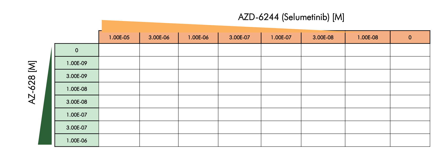
Figure 1: Checkerboard scheme for addition of AZ-628 and Selumetinib to cells.

Cells were seeded in white cell culture-treated flat and clear bottom multiwell plates and incubated at 37 °C o.N. before compounds were added. Compound treatment of cells started one day after seeding with a final DMSO concentration of 0.1% and was performed by nanodrop-dispensing using a Tecan Dispenser. 0.1% DMSO (solvent) and Staurosporine (1.0E-05 M) served as High control (100% viability) and Low control (0% viability), respectively. Compounds were added to the cells in a checkerboard pattern as below.